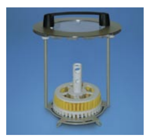
HistosMATE universal stainless steel holder suitable for all types of racks